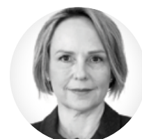
The Hon Jaala Pulford